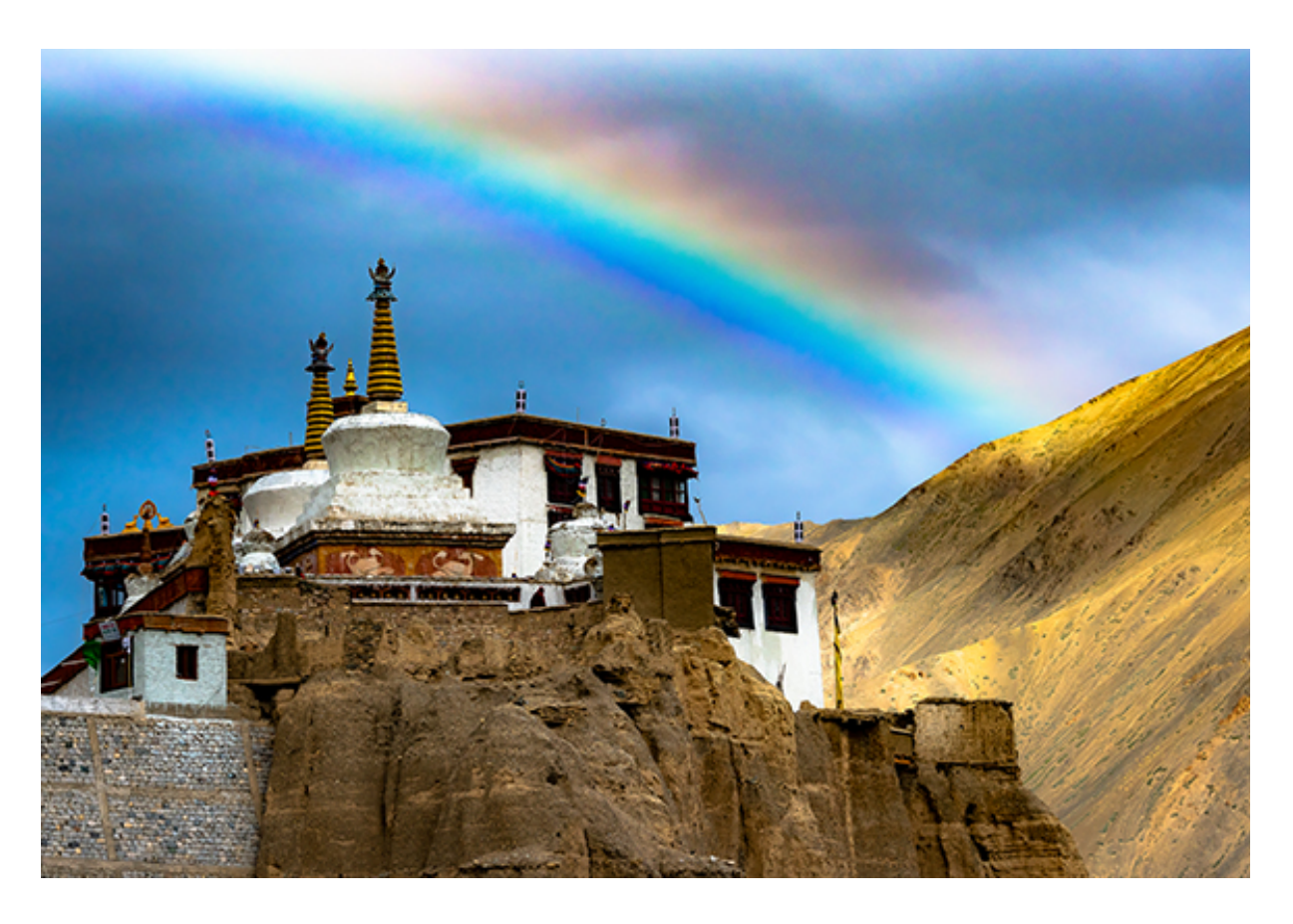
Lamayuru Monastery, Ladakh, India, 2018. Archival pigment inks on archival French platine paper, Edition 1/6. 13.75" x 20.625" Signed and dated lower right, titled lower left.

The Frejs first visited Nepal in 1981 on a month-long trek around Manaslu, the eighth highest peak in the world.