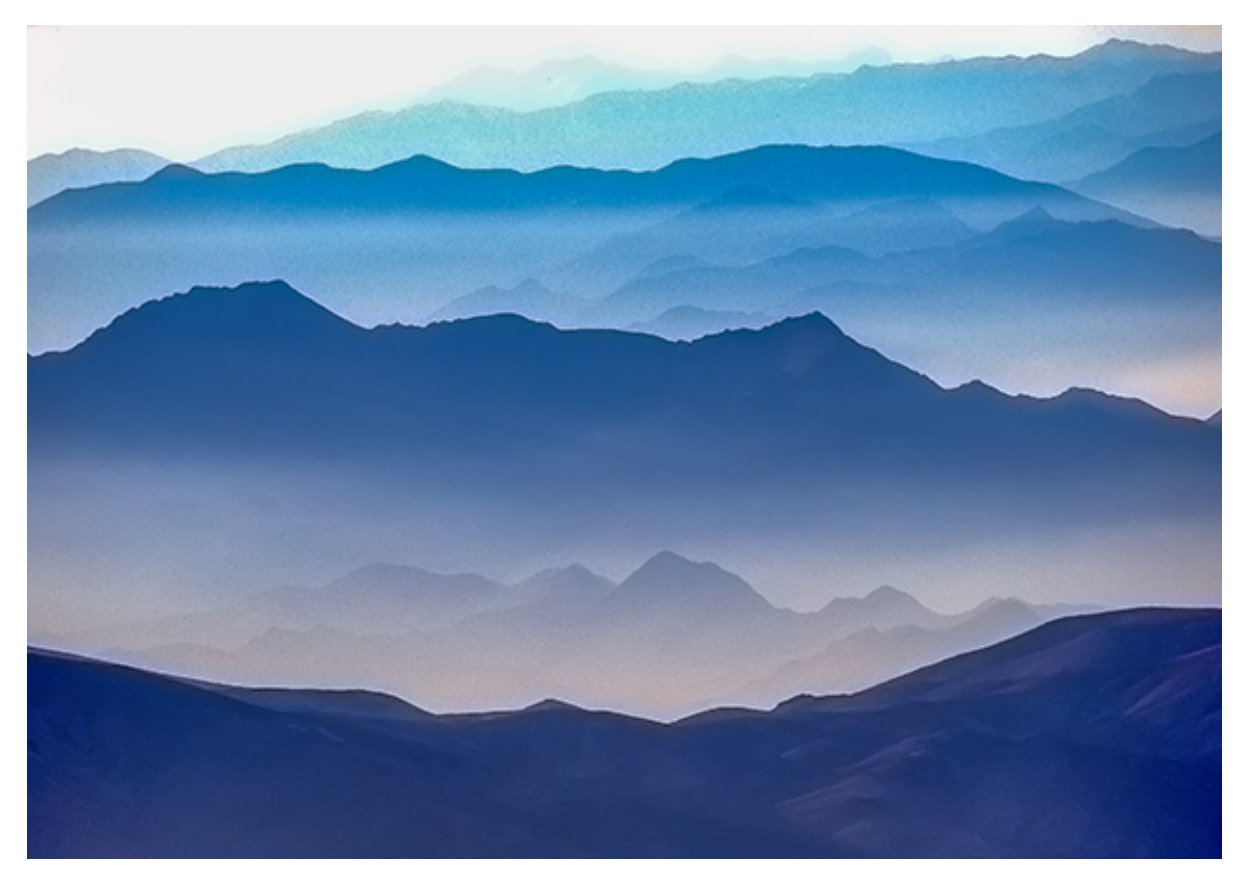
The Hindu Kush, north of Kabul

Afghanistan, 2009 Archival pigment inks on archival French platine paper Edition 1/6